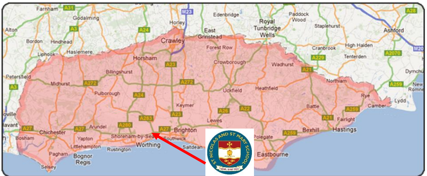
This is a modern map of the Diocese of Chichester. It also shows the location of St Nic's.

Can you find where you live? Where is the city of Chichester?