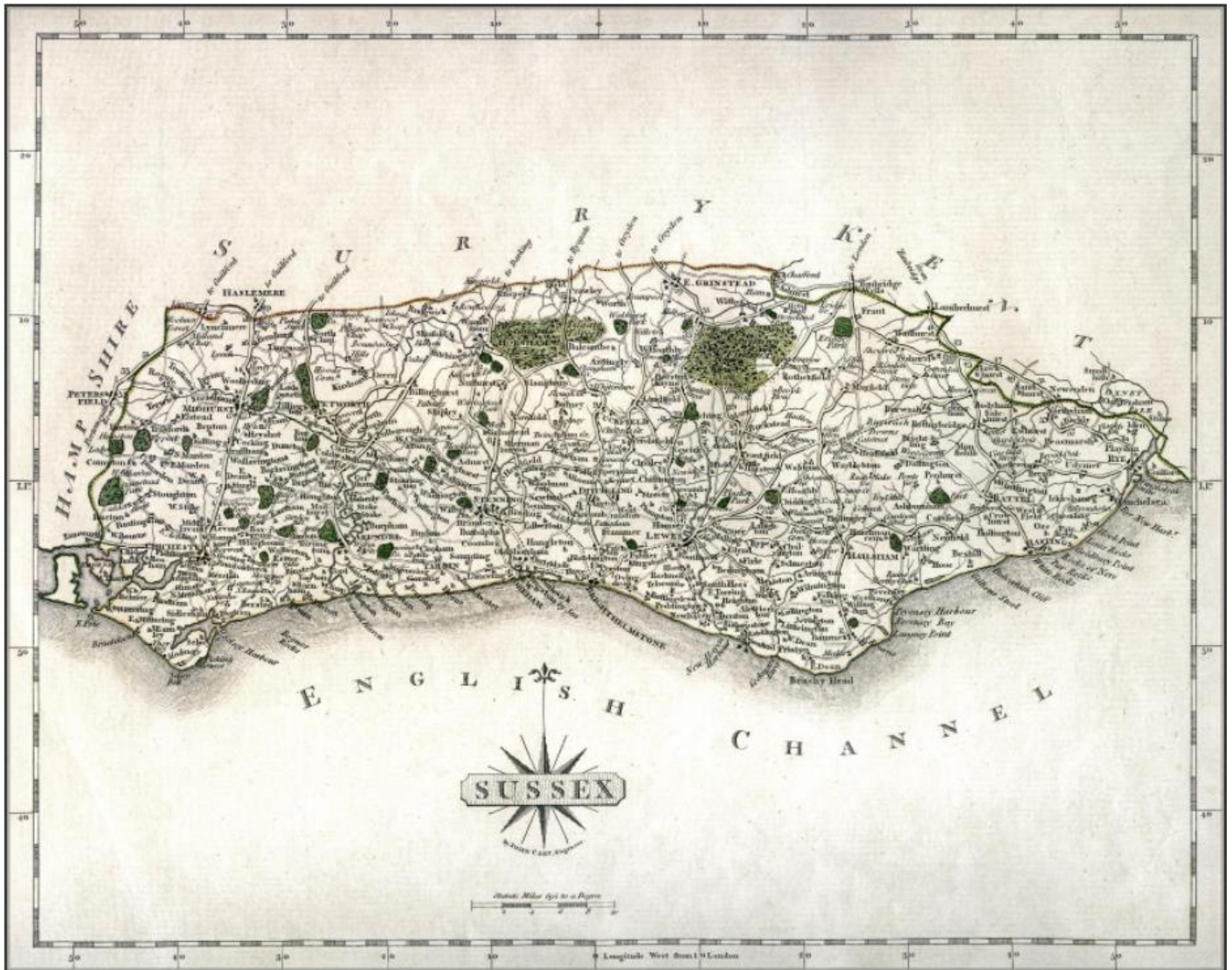
This map of Sussex was published in 1787 when William Otter was 9 years old.