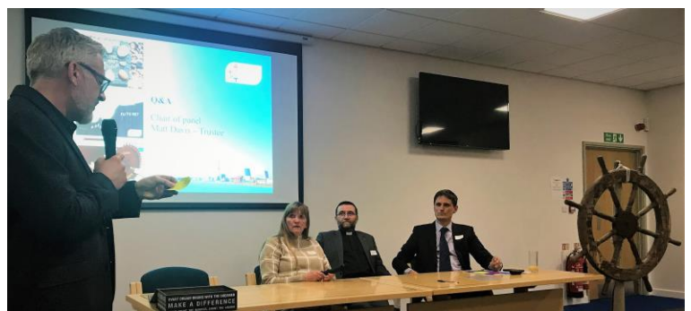
Q&A with the BOAT panel

This has been a long journey, especially for St. Nic's and St Mary's governors, in building the foundations for the BOAT many years ago, going forth with meetings and consultations with our school community and always journeying together, guided by God, to do the best we can. Because this is doing the best for our children who come to St Nics and St Mary's, to create a family of schools that will support each other and learn from each other to provide the best rounded education we can with learning and wisdom for life. '